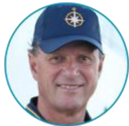
Dr. Robert Ballard

The AUVSI XPONENTIAL 2020 keynotes feature trailblazers from across industry, government, and academia, all coming together to share how — as a community — we can reach the next summit for unmanned systems and advance the unmanned industry together.